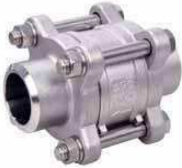
Fig no. WA-002B Full Bore 1/4" ~ 4" DN8 ~ 100